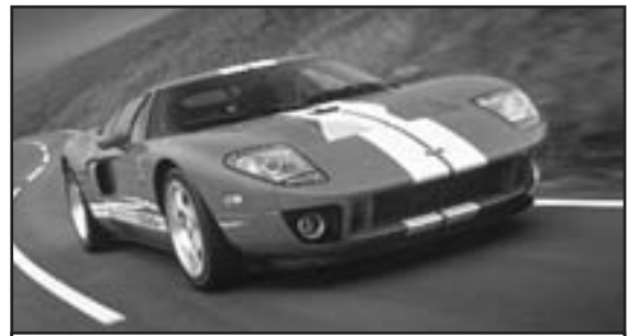
Ford GT Powered by 5.4L Supercharged Modular Engine with Manley H-Beam Steel Connecting Rods

P/Ns 14040-8 & 14041-8 are NHRA Legal for Stock & Super Stock.