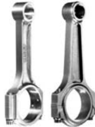
Sportsmaster® Pro Series Lightweight "I" Beam